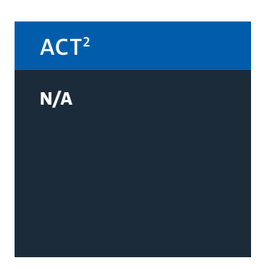
Table 7: General insurance duty<sup>1</sup>